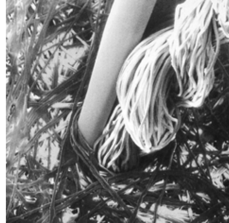
▲ During tufting the continuous fibers of Typar® are not damaged but displaced to form a reinforcing collar around tufts. ▼

DuPont has shown continuous commitment for quality and the environment. The Luxembourg site has received certifications in accordance with ISO 9001 and ISO 14001 and is EMAS registered in accordance with EU regulation No.1836/93